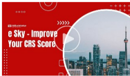
Improve Your English Language IELTS Score!

Express Entry Six Month Review: History Made With First Occupation-Specific Draw